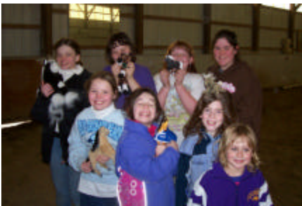
Unmounted Horse Show