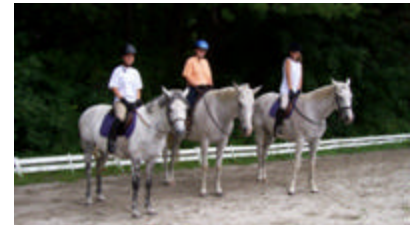
Summer Horsemanship Programs July & August