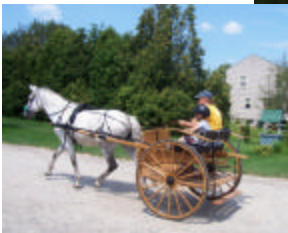
Nina w/new cart