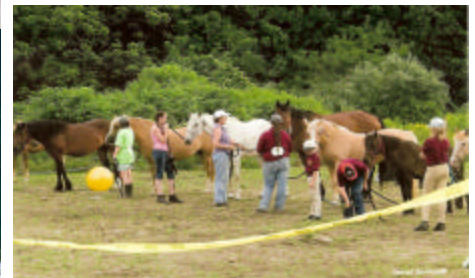
AAPHne Horsemanship Meet